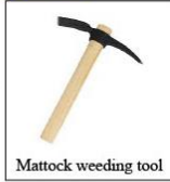
Mattock weeding tool

The goal of this project is to help reduce and eradicate invasive weeds threatening the native plant community of the local area. Target weeds are dyers woad, burdock, houndstongue, poison hemlock, white bryony, teasel, mullein, dog rose, and other invasive plants. Control methods will include hand pulling, digging and possible bagging. Participants may redeem bags of dyers woad for Cache County's "Bag O' Woad" promotion.